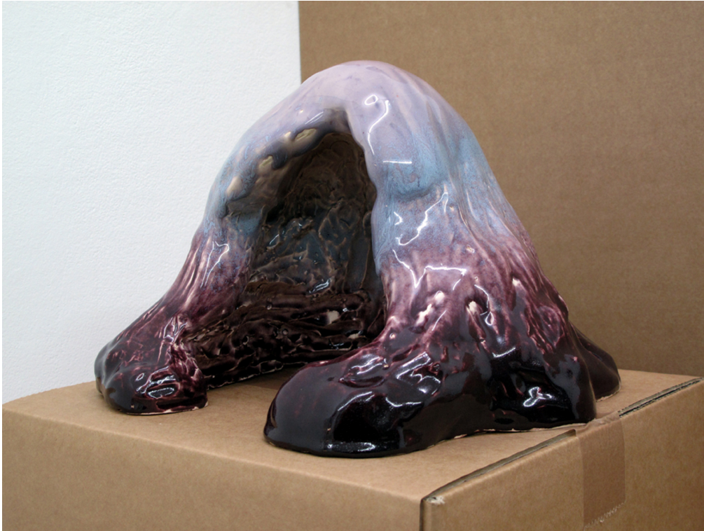
Legend : Exhibition view, Golden Age, Florian Bézu, Florence Loewy, Paris, 2012