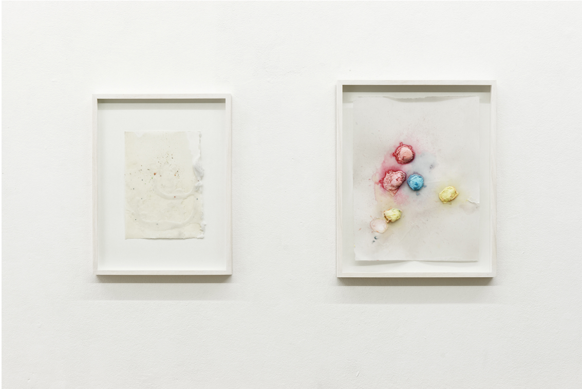
Legend : Exhibition view, Golden Age, Florian Bézu, Florence Loewy, Paris, 2012