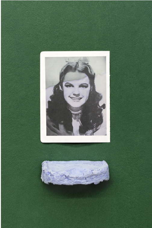
Legend : Exhibition view, Golden Age, Florian Bézu, Florence Loewy, Paris, 2012