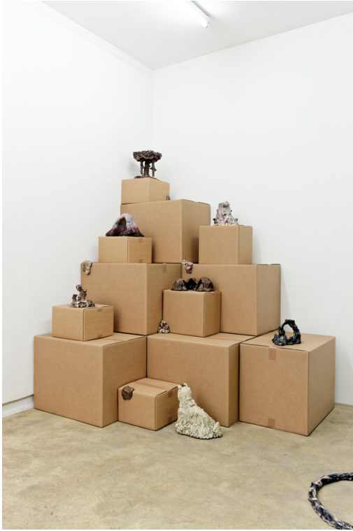
Legend : Vue de l'exposition Golden Age, Florian Bézu, Florence Loewy, Paris, 2012