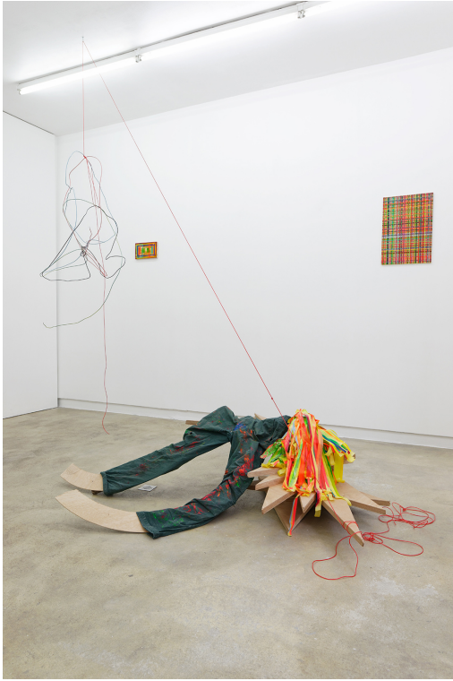
Legend : Exhibition view Charlie Hamish Jeffery, I can't believe it's not you, Florence Loewy, Paris Photo