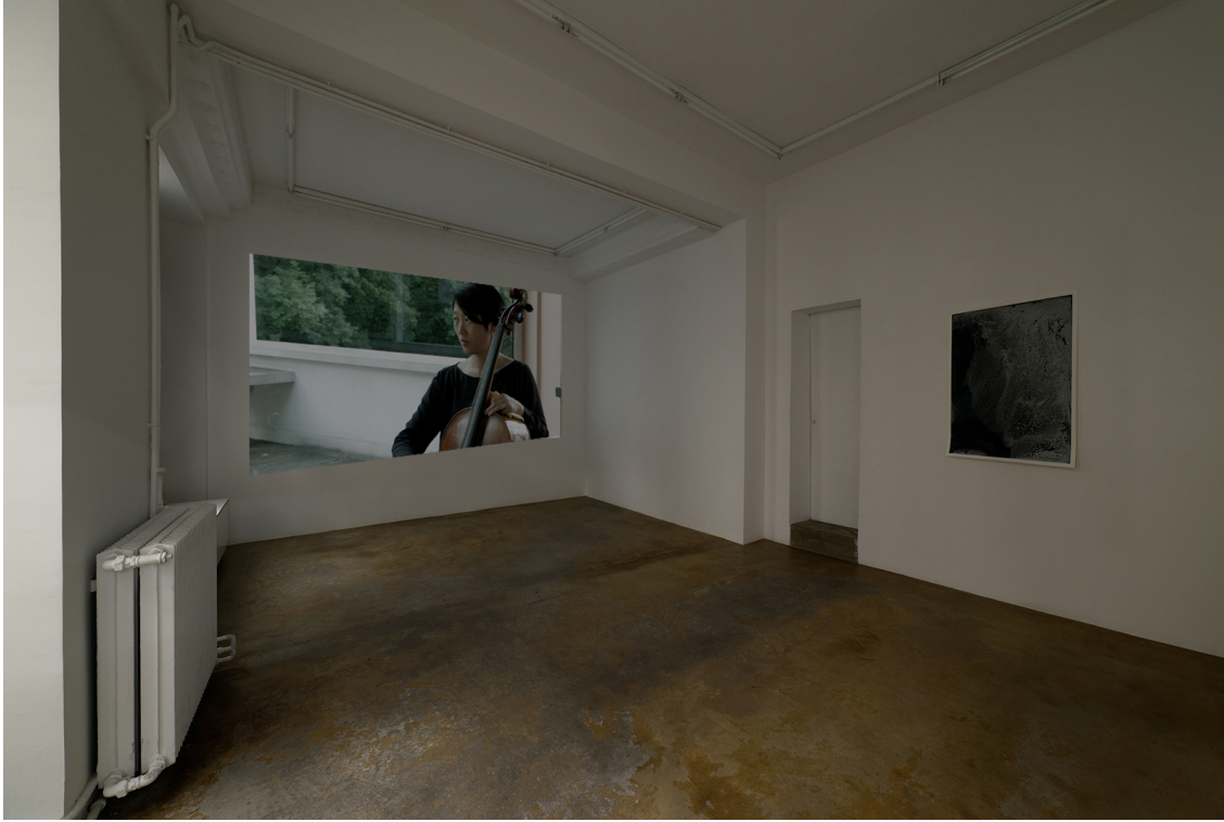
Legend : Exhibition view Joan Ayrton, Slow Melody Time Old , Florence Loewy, Paris