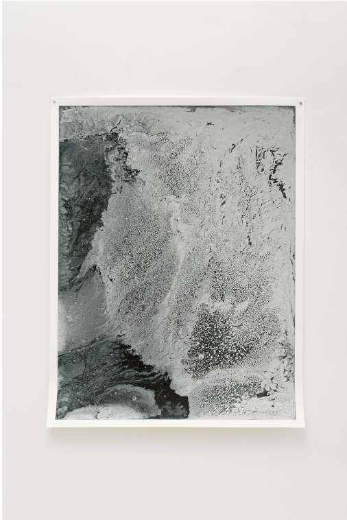
Legend : Flow, 2017, Impression sur papier / Exhibition view Joan Ayrton, Slow Melody Time Old, Florence Loewy, Paris